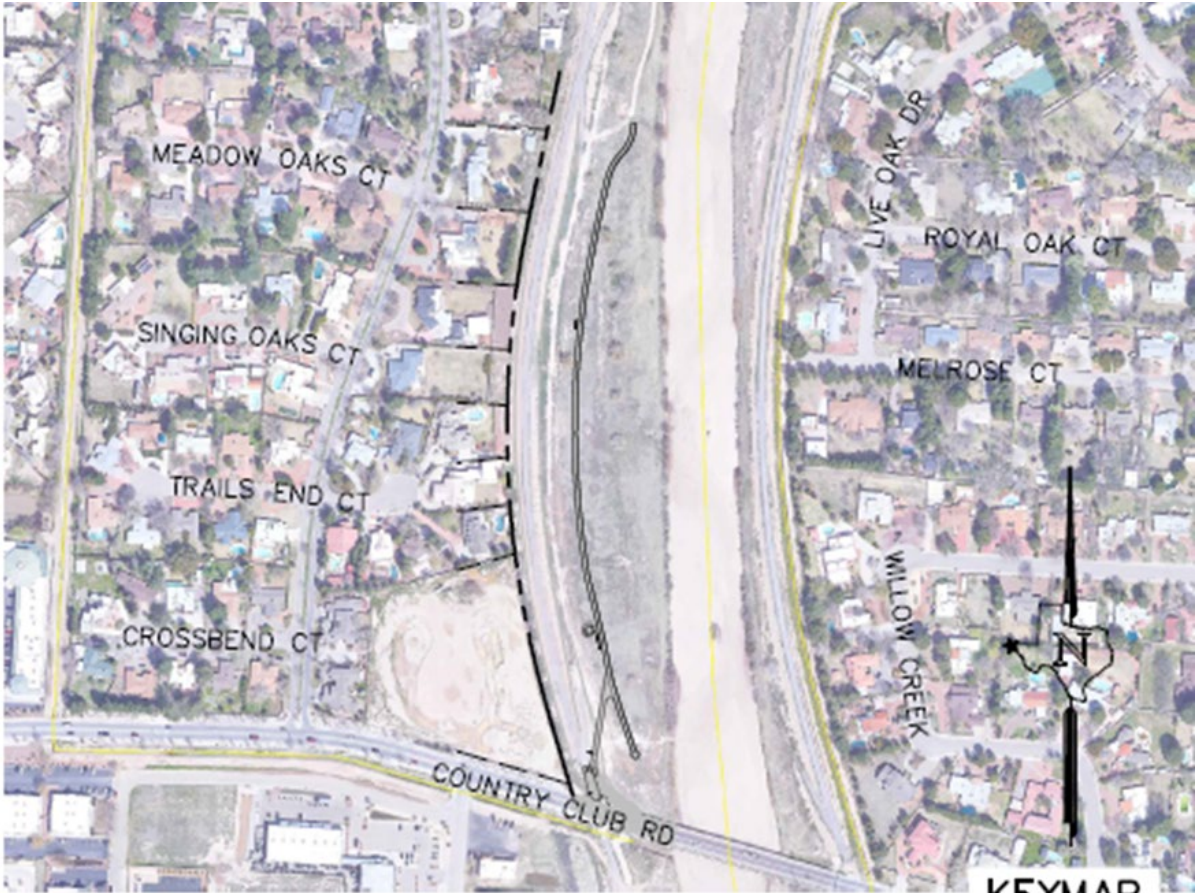
KEYMAP SCALE: 1" = 400'