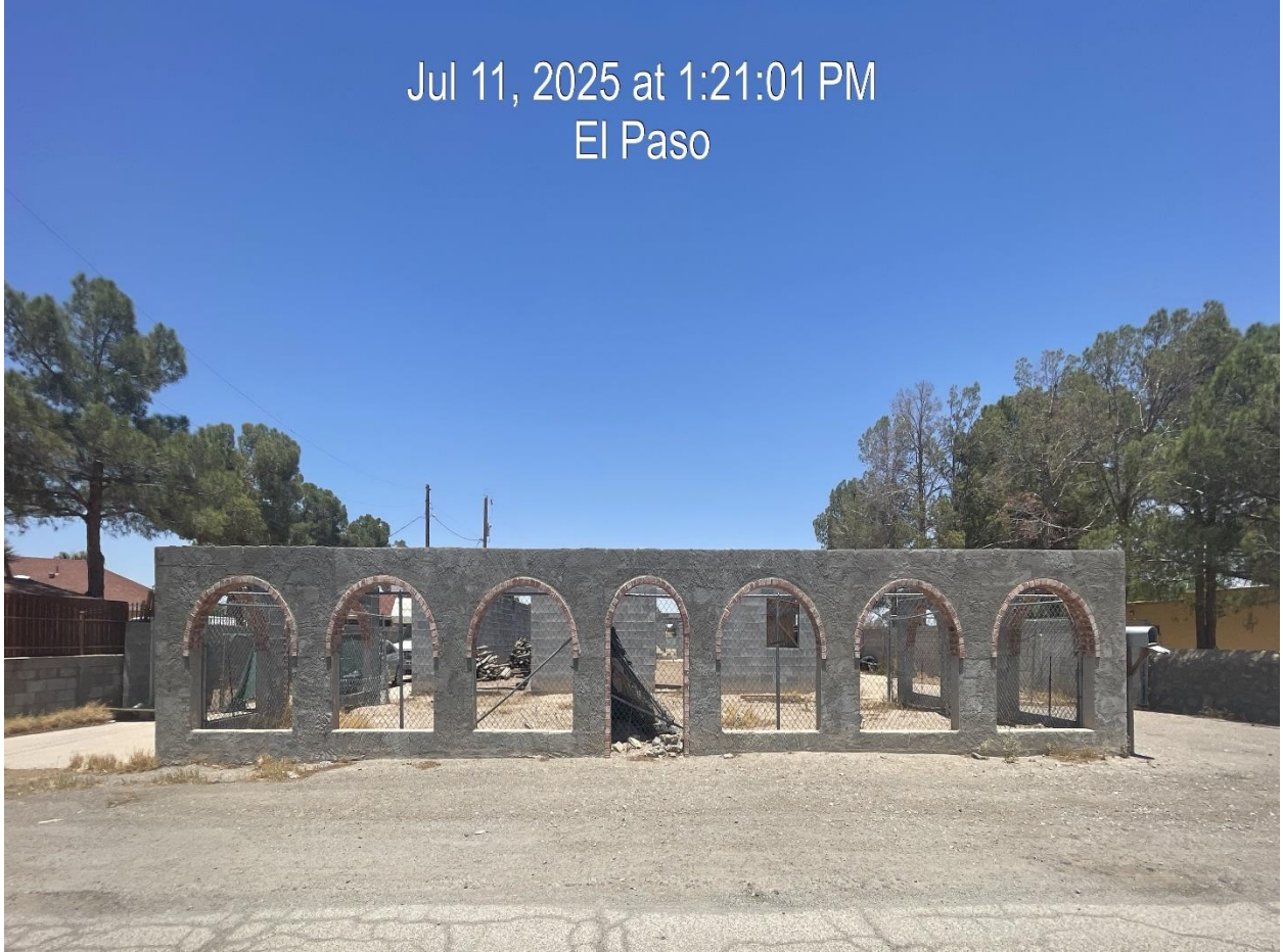
Front elevation picture