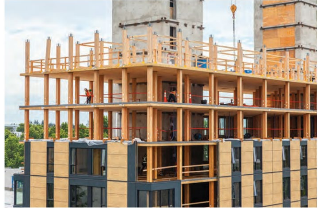
Mass timber construction.