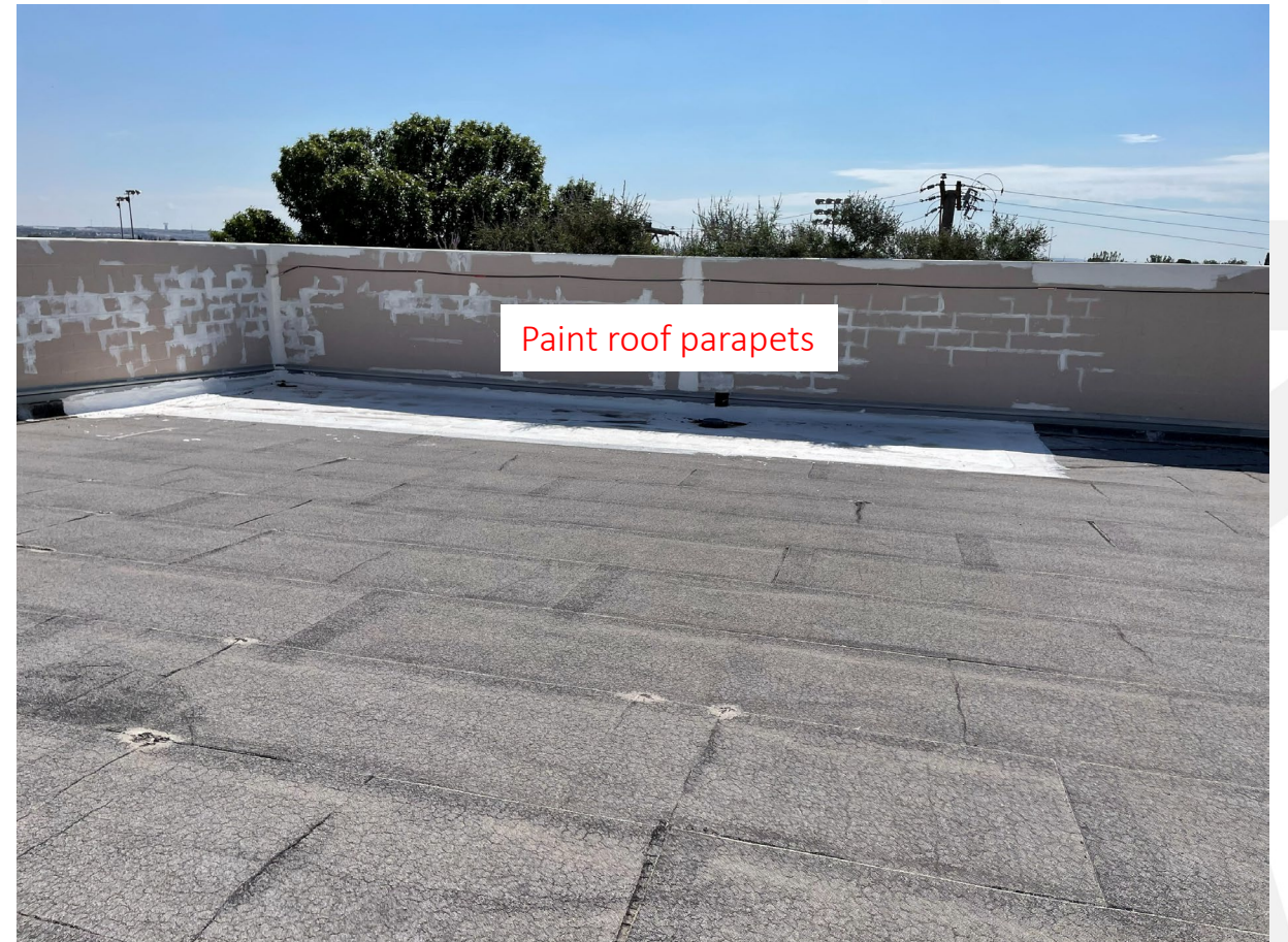
Paint roof parapets