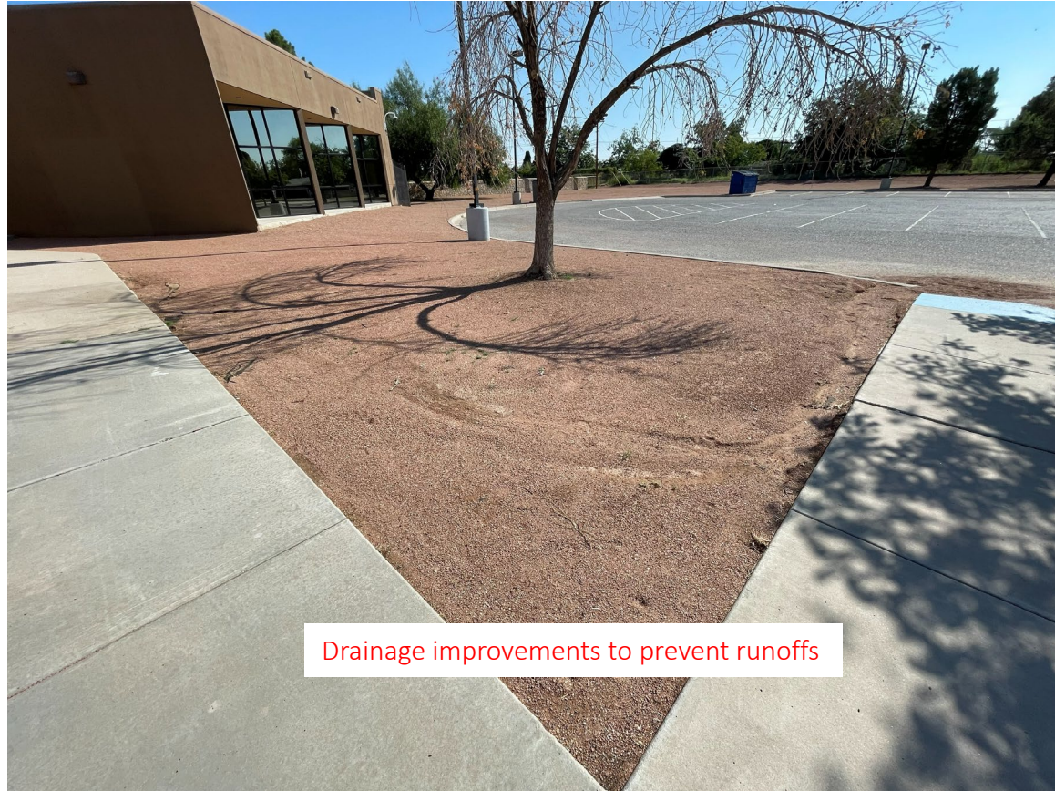
Drainage improvements to prevent runoffs