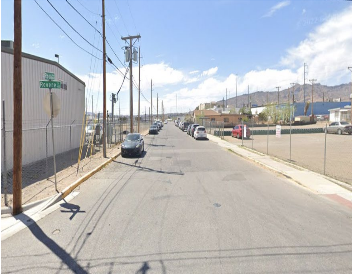
Existing Rosa Avenue