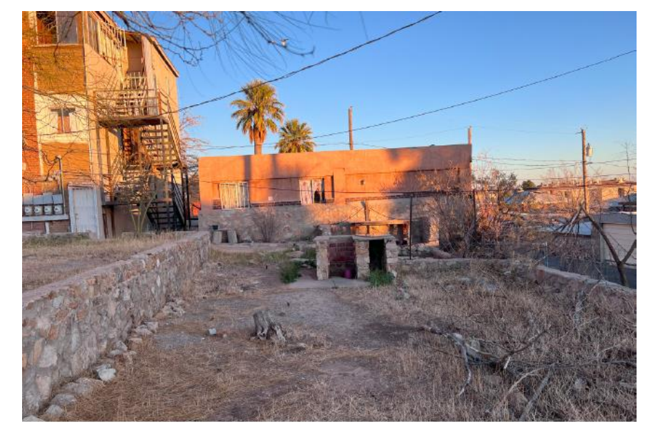
West - Alley

This text box is to remind you about the ASL translator service. Do NOT add any info in this space.