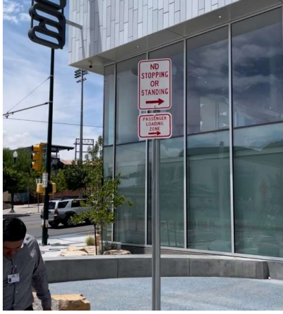
North Side of W Main Dr: No Stopping or Standing, Passenger Loading Zone