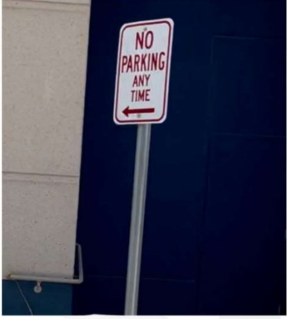
South Side of W Main Dr: No Parking Any Time