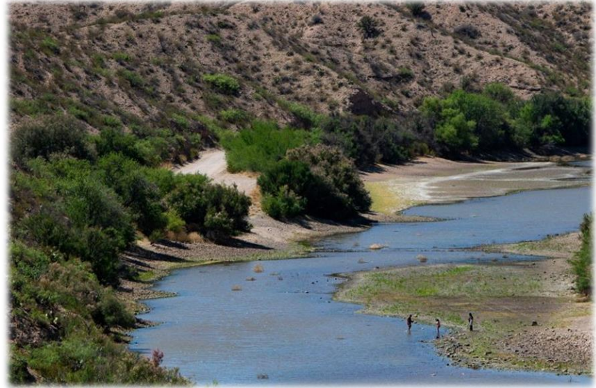
Rio Grande at Caballo Lake State Park, New Mexico.