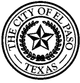
Exhibit A City of El Paso Streets and Maintenance Traffic Control Permit